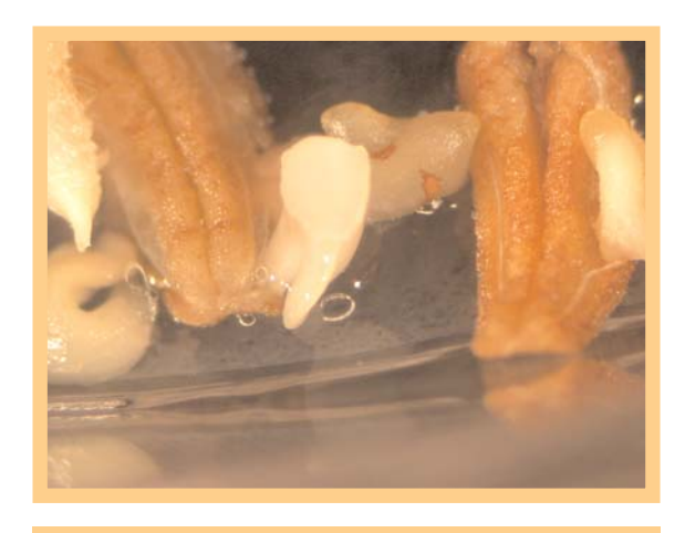
Figure 3 Developing embryos from anthers of potato cultivar Pito.

somatic embryogenesis through each of the characteristic stages (corresponding to the developmental stages observed in zygotic embryogenesis) was performed by a detailed histological analysis (Fig. 2). Specific patterns of gene expression at each developmental stage are currently being investigated.