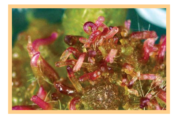
Figure 1 High efficiency production of somatic embryos from internodal explant of potato cultivar "Desiree"

on to an intact plant. Two other forms of embryogenesis, gametic and somatic, analogous to the normal pathway of zygotic development can be induced in vitro , and have wide implications and applications in basic and fundamental studies.