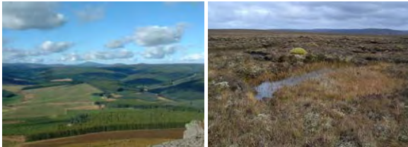
How will changes in land use affect the provision of ecosystem services?

Consequences of GHG reduction targets and adaptation responses for Scotland's environment, land use, and rural communities need to be better understood, as do the management systems needed to encourage sustainable landscapes in the face of changing climate.