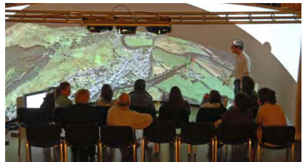
A Visual Landscape Theatre can be used to explore the implications of different landscapes to help build consensus between stakeholders on land use choices.